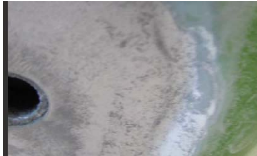
Pitting Found After Sanding Example (Fig. 1)

Note: If pitting is found during the sanding process, please use LOP 23-75-XX-XX for up to 0.5 hours in conjunction with the 23-85 replacement LOP.