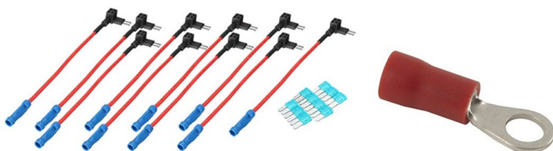
Dual Circuit Car Auto Truck Micro2 Fuse Adapter Tap

Before having the Aux switches I used a Micro2 Fuse Tap in P58 for passenger heated seats... Depending on your needs there are several fuses that can be tapped but you want one that only comes on with the ignition or accessories and not running of the battery all of the time... For grounding I used a ring terminal similar to above that I crimped and used a heat gun to shrink the insulator for a solid connection and then