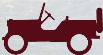
PRV - Snazzberry (Option)