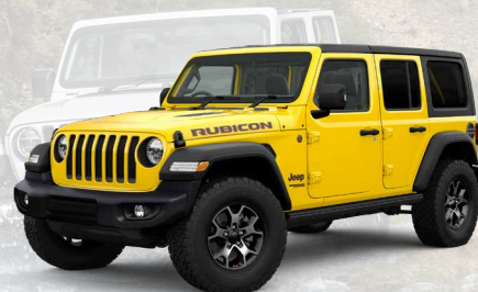
PYV - HellaYella (Option)