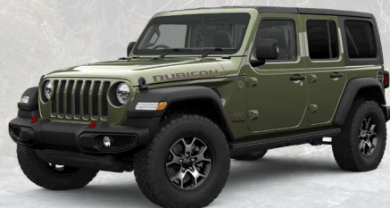
PGG - Sarge (Option)