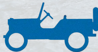
PBJ - Hydro Blue (Option - December 2020 Availability)