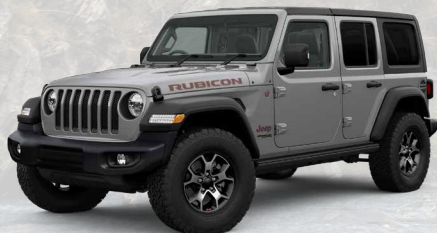
PDN - Sting Grey (Option)