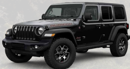
PX8 - Black (Standard)