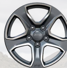
WBG - 17-Inch Polished Granite Crystal Wheels (Standard on Sport S)