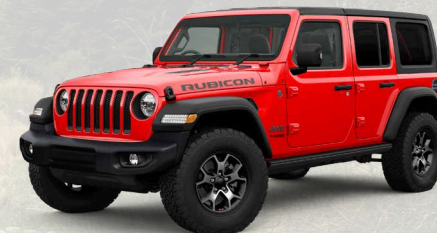
PRC - Firecracker Red (Option)