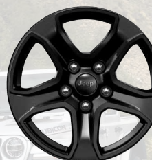
WFL - 17-Inch Painted Black Alloy Wheels (Standard on Night Eagle)