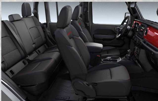
D5X9 - Black Premium Cloth Low-Back Bucket Seats (Standard - Rubicon)