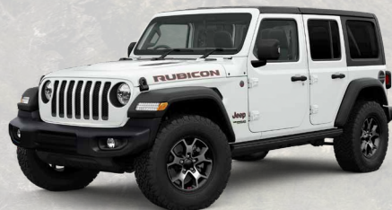
PW7 - Bright White (Standard)