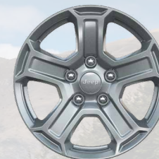
WF9 - 17-Inch Tech Silver Alloy Wheels (Option on Sport S)