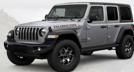
PSC - Billet Silver (Option)