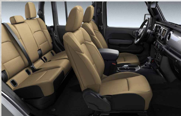
A7T5 - Black/Heritage Tan Cloth (Option - Sport S)