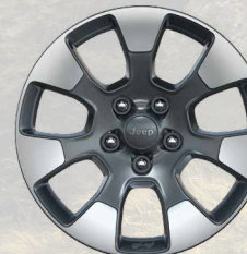
WGB - 18-Inch Tech Gray Diamond Cut Wheels (Standard on Overland)