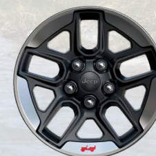
WGR - 17-Inch Black Wheels with Polished Lip (Option on Rubicon)