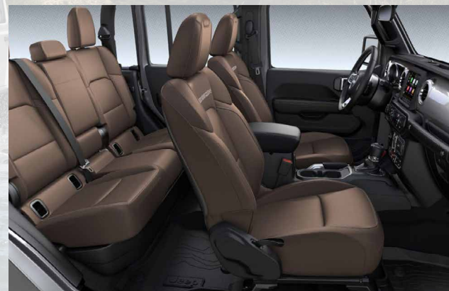
ALTV - Dark Saddle Leather Trimmed Bucket Seats (Option - Rubicon)