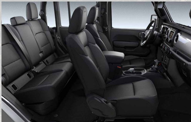
A7X9 - Black Cloth (Standard - Sport S & Night Eagle)