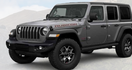
PAU - Granite Crystal (Option)