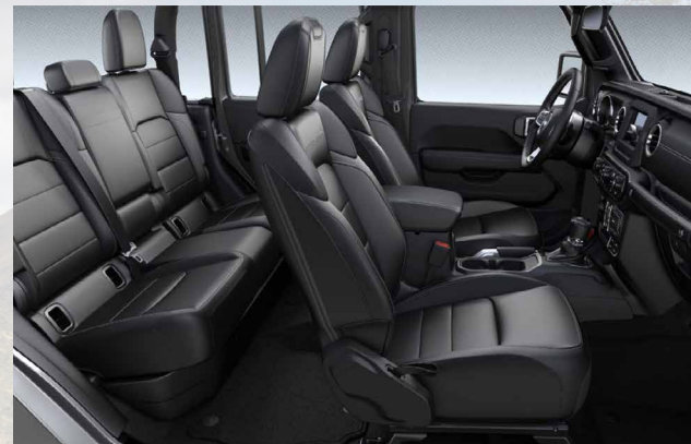
MLX9 - Black McKinley Leather with Overland Logo (Standard - Overland)