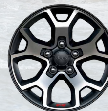
WGM - 17-Inch Polished Wheels with Black Pockets (Standard on Rubicon)