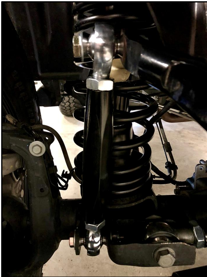
Passenger's side connection