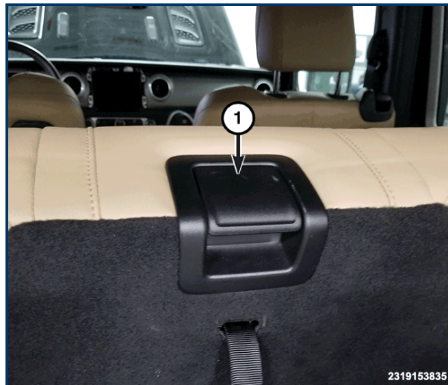
1 - Seat Back Release Lever